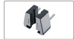
V-shaped jaws (included)