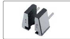
flat jaws (included)